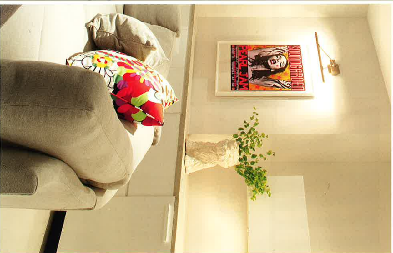
Left: The 'S' Sofa was custom designed for the main living area. Below: Pops of color were used throughout the apartment.

"Whilst there is definitely a rhythm to the entire space and it flows easily from one space to the next, each room is unique."